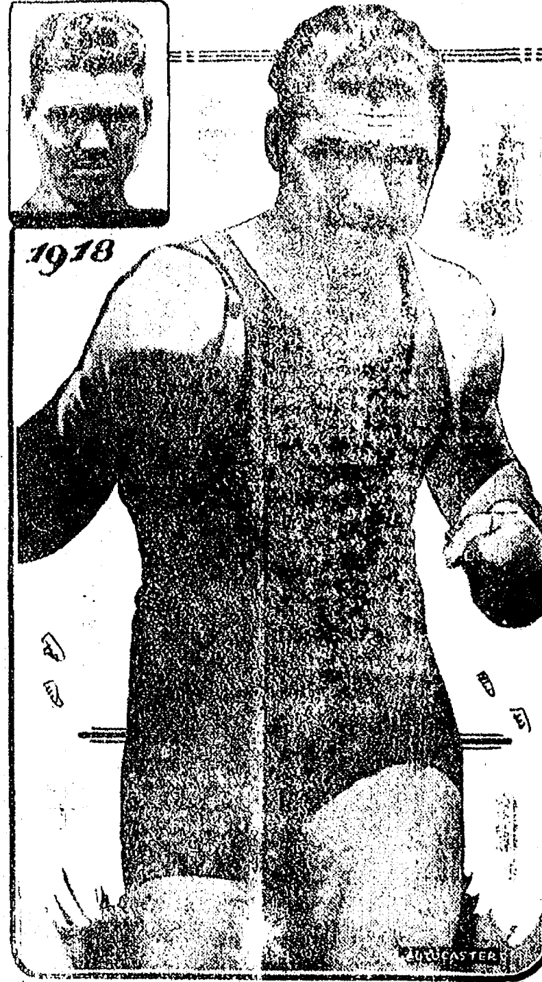
Champion Jack Dempsey, as photographed last Thursday at his Saratoga Springs, N. Y. training camp, where he is preparing for battle in New York Sept. 14, in defense of his title against Louis Firpo, South American challenger. Some critics opine that Dempsey has passed his prime and faces the danger of losing his crown to the big Russian fighter from the South.

sey of today and the Dempsey of five years ago is MONEY. Today, Dempsey is a wealthy man. For the last five years he has been living on the fat of the land, enjoying luxuries and comforts which were entirely outside his ideas of possibilities five years ago. Then, too, there is the "toll of idleness" which few are strong enough to resist. It is doubtful if Dempsey has been a severe enough taskmaster for himself to evade paying physically for it.